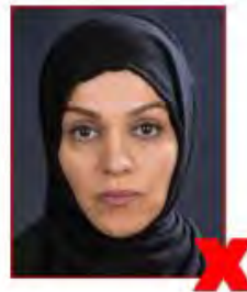
Background too dark