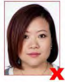
Hair obscuring face