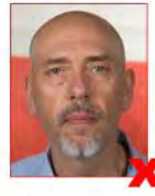
Background not plain