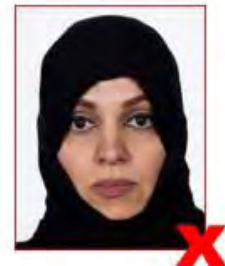
Eyes/edges of face obscured