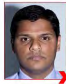
Shadows on image and background