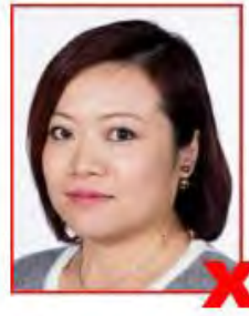
Side on to camera